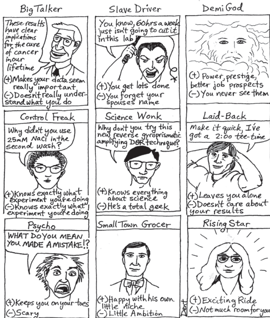
Figure 2 | The nine types of principal investigator. This cartoon was kindly provided by Alexander Dent, http://dentcartoons.blogspot.com .

Skills, not papers. Contrary to what you might have heard, it is not critical to have a spectacular publication record from your Ph.D. When the time comes to apply for a tenure-track job, the selection committee will focus on the productivity and promise you displayed during your postdoctoral fellowship. Furthermore, a solid Ph.D. with one good first-author paper that is based largely on your own work is all that is usually required to obtain the postdoctoral position of your dreams, particularly for citizens of